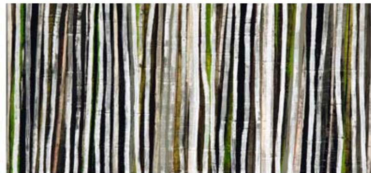
Claudine Marzik Bamboo No. 1

Townsville Civic Theatre Adult $35, Concession $27, Group 10+ $27 each, member (NQ Ensembles Inc) $25, School Student $14, School Groups 10+ @ $12 per ticket with 1 teacher free of charge per 10 students booked. Ticketshop 4727 9797