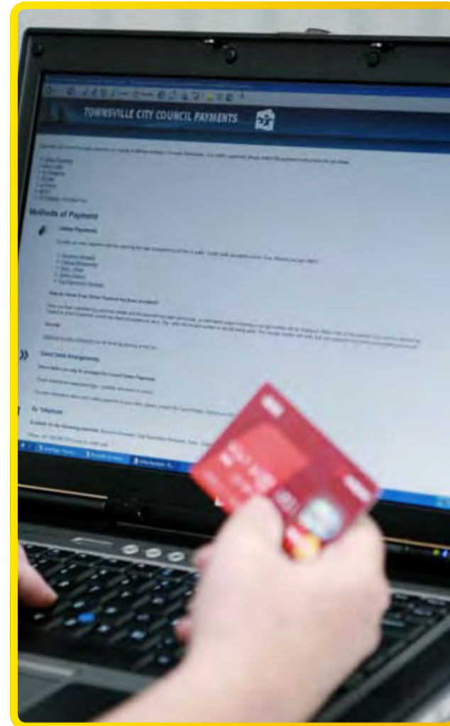
Rate payment is made easy with online services and a direct debit option.

For more information phone 4727 9000, email enquiries@townsville.qld.gov.au or visit www.townsville.qld.gov.au .