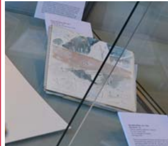
14 August until 9 September 2012 Showcase

Perc Tucker Regional Gallery celebrates the centenary of the birth of four of Australia’s leading modernist artists in this small showcase exhibition of works, chosen from the City of Townsville Art Collection. Working variously in expressive, abstracted or surrealist styles, Russell Drysdale (1912-1981), Noel Wood (1912-2001), Mary Macqueen (1912-1994) and Bernard Boles (1912-2001) made sustained contributions to 20th century Australian art, always seeking to create evocative images of the Australian landscape and its people.