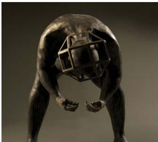
Xstrata Kids and Teens Exhibition Featuring Simon Gilby's The Syndicate 3 February until 8 April Ground Floor

Go Figure! is the 2012 Xstrata Kids and Teens exhibition. The exhibition centres on ten life-size sculptures, collectively entitled The Syndicate , by Simon Gilby. Gilby describes his figures as portraits “of real or imagined characters”. In the catalogue essay, Ted Snell writes “...in that strange amalgam we discover the core of their power. They are us, they reflect back our fears and doubts and in this exchange we become more human, more empathetic, more alive.”