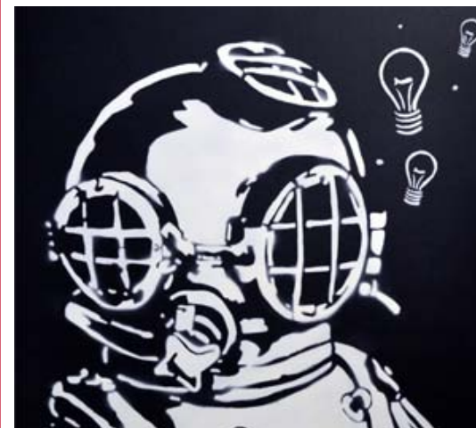
2012 Youth and Emerging Artist Exhibition 13 until 29 April 2012 Ground Floor