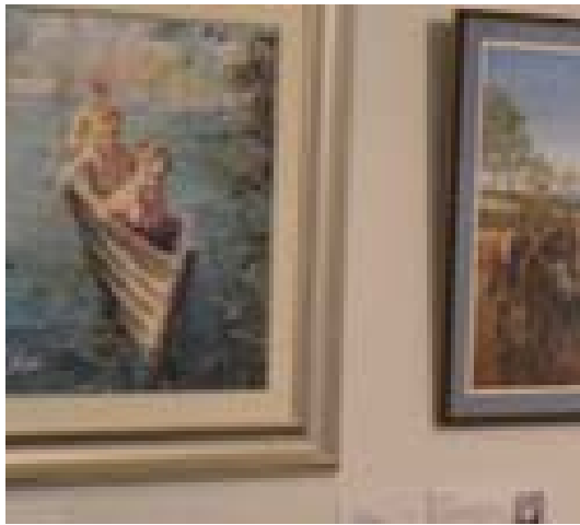
Seniors Week Exhibition Organised by the Townsville Region Committee on the Ageing 14 August until 2 September 2012 Access Gallery