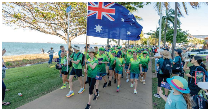
World Triathlon Multisport Championships