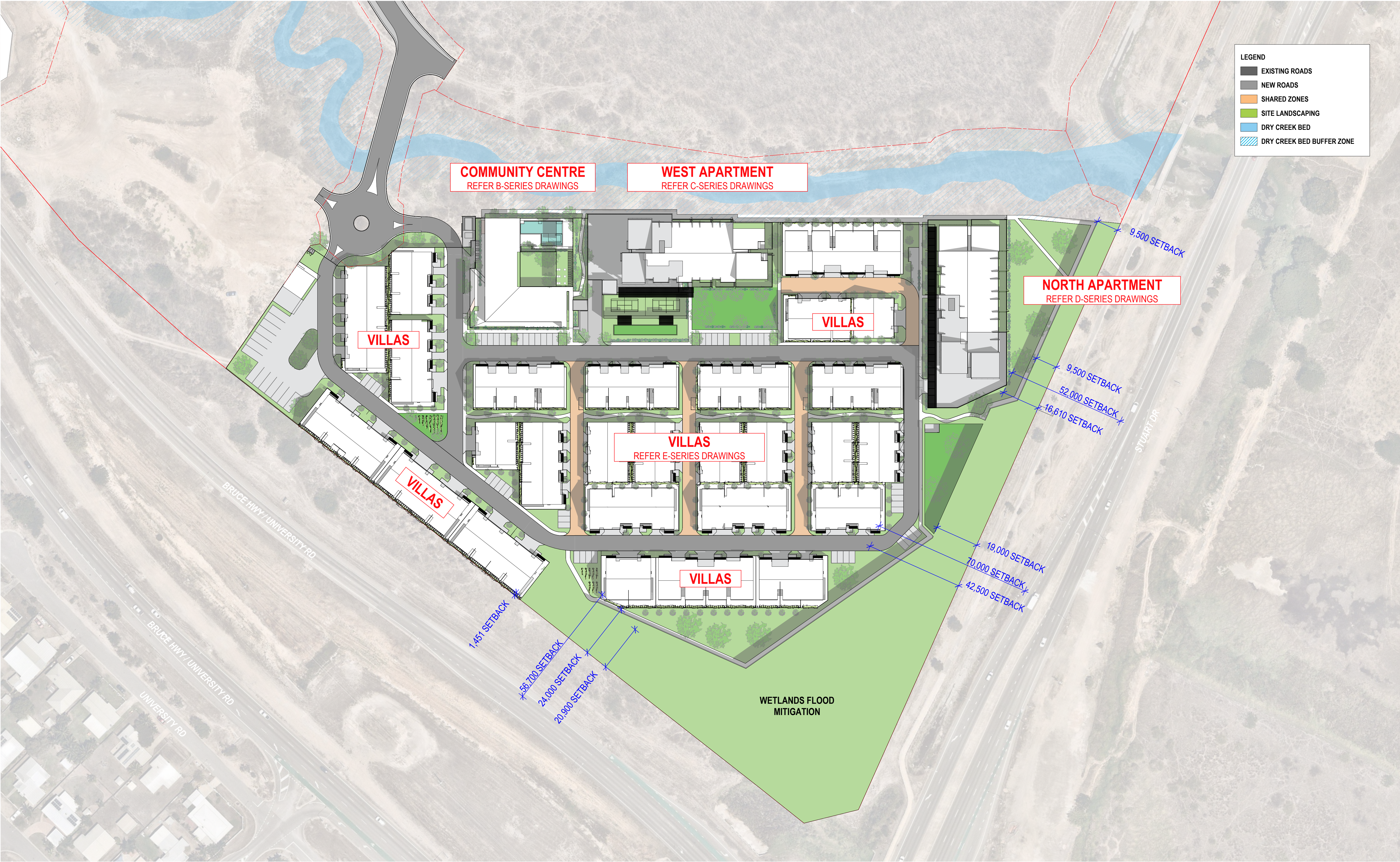
1 SITE PLAN - RETIREMENT LIVING VILLAGE SCALE 1:750 @ A1 SCALE 1:1500 @ A3