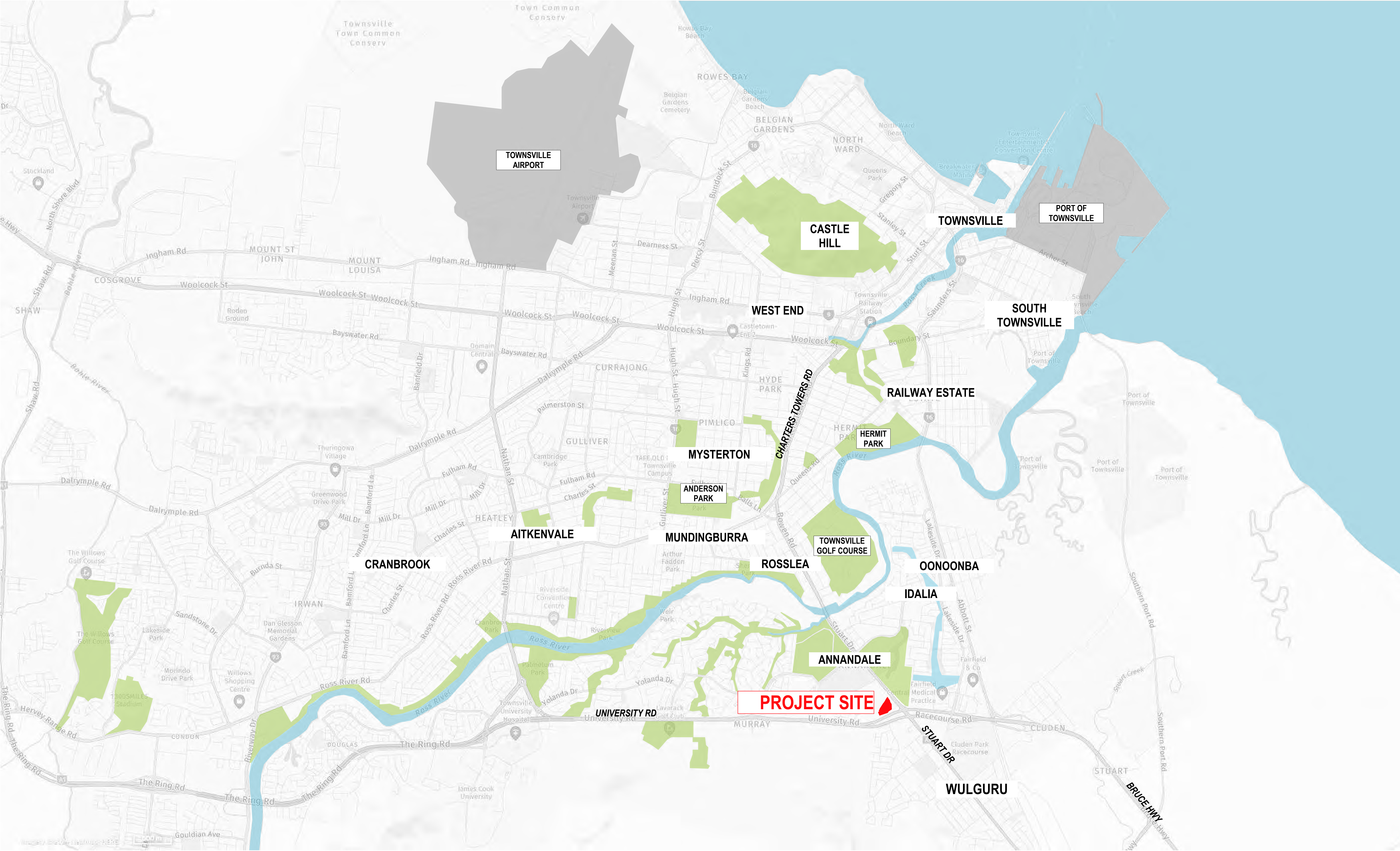
1 MACRO PLAN