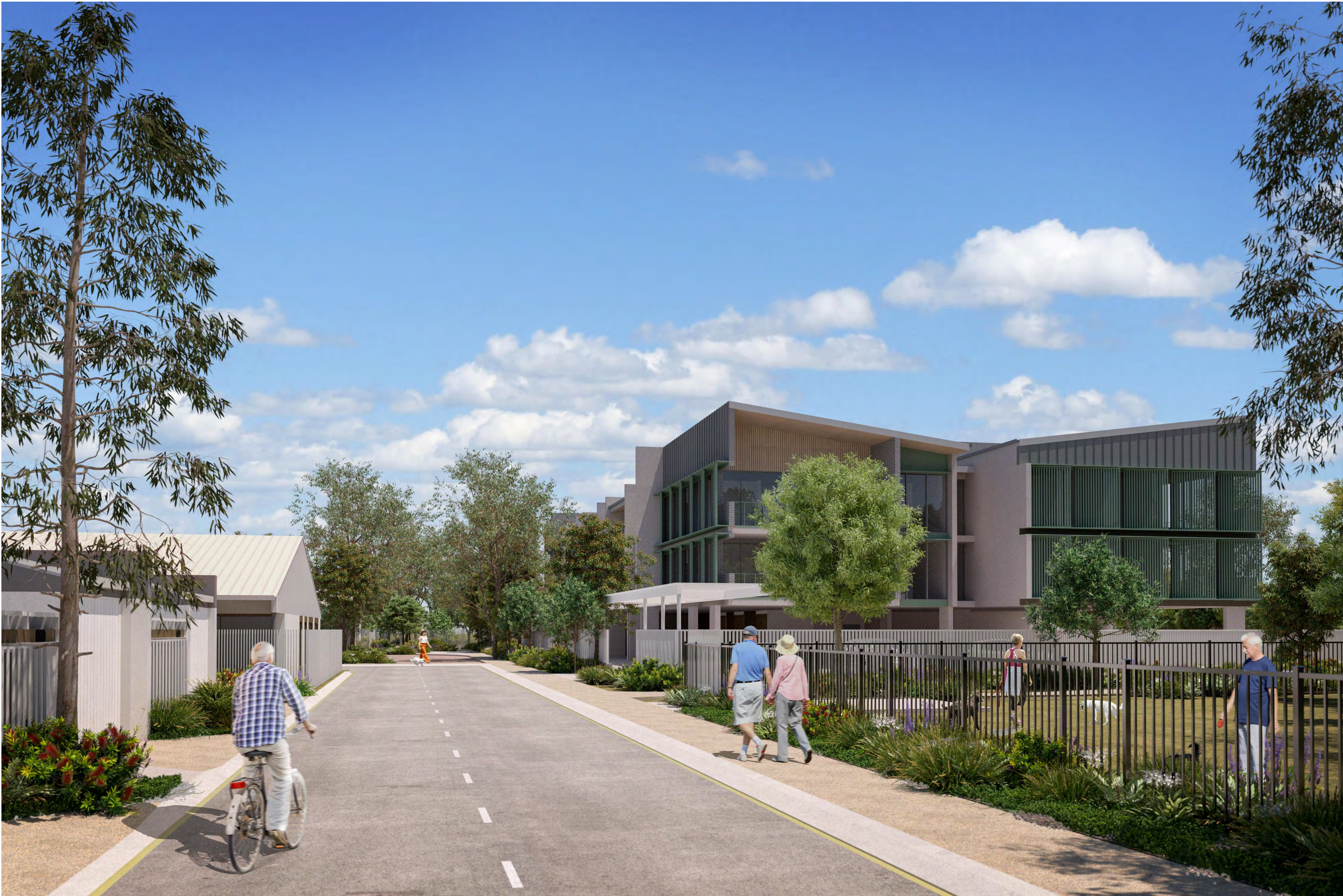
1 ARTIST'S IMPRESSION - APARTMENT NORTH & DOG PARK -