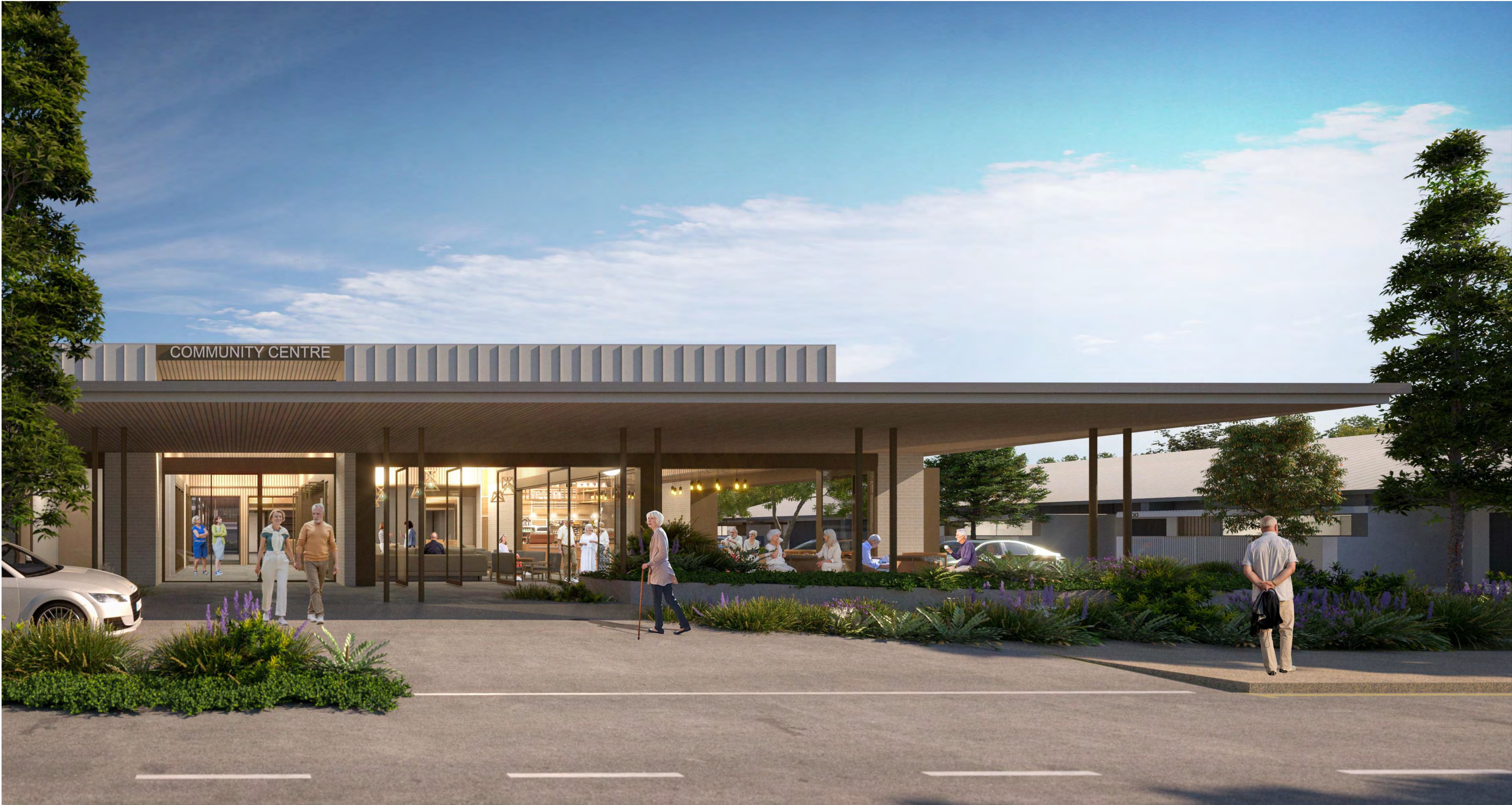
1 ARTIST'S IMPRESSION - COMMUNITY CENTRE