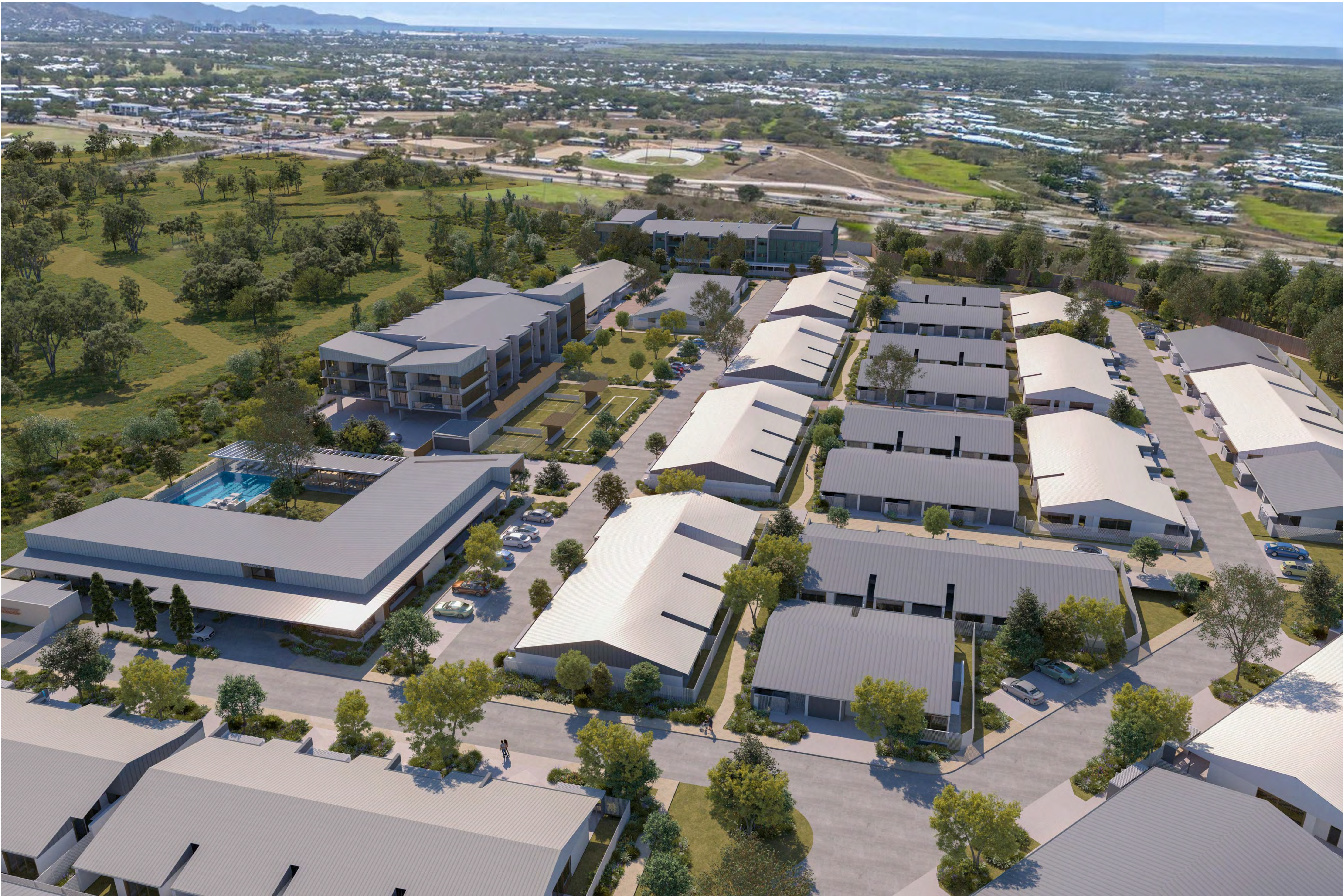
1 ARTIST'S IMPRESSION - AERIAL VIEW OF RETIREMENT VILLAGE