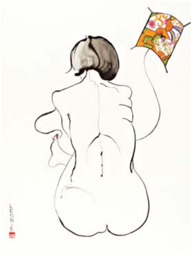
Image: Leonie Wood, Flight of Fancy 2012 Sumi ink, pen and watercolour pencil, 76 x 56 cm