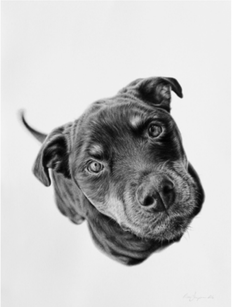
Image: Elissa Sampson, Unconditional 2016 Graphite and charcoal on paper, 40 x 30 cm Winner of the Percival Animal Portrait Prize 2018 Perc Tucker Regional Gallery, Townsville