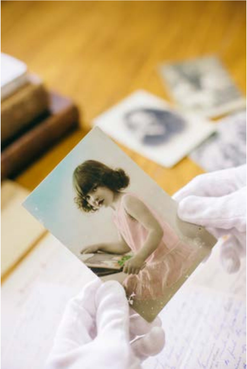
Image: An archived photograph from the JCU Library Special Collections