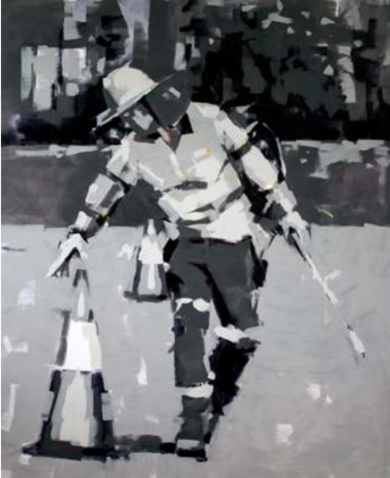
Image: Andrea Huelin, Cone Man 2019 Acrylic on canvas, 180 x 150 cm Image courtesy of the Artist