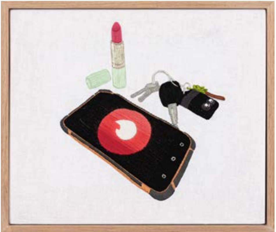
Image: Regi Cherini, Friday Night Out 2019 Embroidery floss on cotton, 32 x 27.5 cm