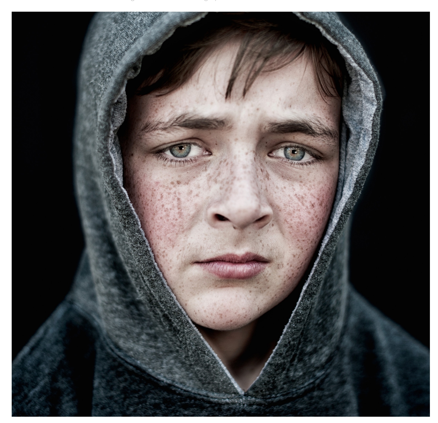
DUO Magazine Percival Photographic Portrait Prize Exhibition Dates: 13 May - 10 July 2016

2016 marked the return of the DUO Magazine Percival Photographic Portrait Prize , an exhibition launched by Pinnacles Gallery in 2014. This prize was started to coincide with the highly popular Percival Portrait Painting Prize at Perc Tucker Regional Gallery and ensure a city-wide celebration of portraiture.