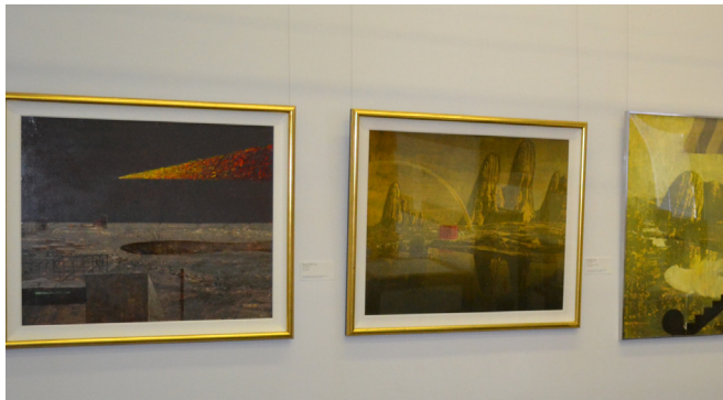
THE PROMISED LAND: THE ART OF LAWRENCE DAWS A CALOUNDRA REGIONAL GALLERY TOURING EXHIBITION 11 February until 10 April

Batik, a cloth that traditionally uses a manual wax-resist dyeing technique, has special meanings rooted to the Javanese conceptualisation of the universe. The three major Hindu Gods, Brahmā, Visnu, and Śiva, are represented by the colours indigo, brown and white, dictated by the fact natural dyes are most commonly available in indigo and brown. Patterns in the batik also reflect a person's nobility.