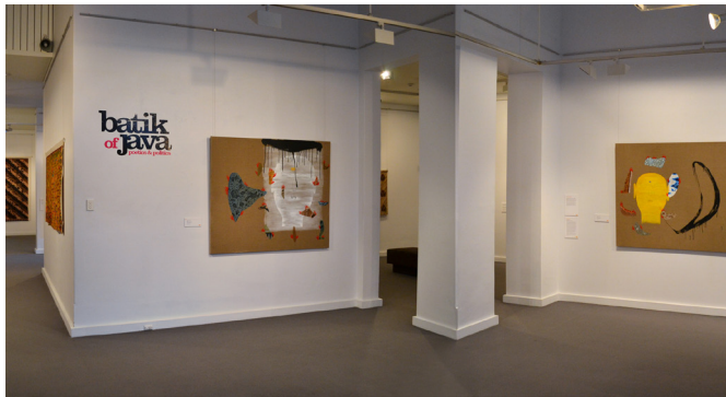
BATIK OF JAVA: POETICS AND POLITICS A CALOUNDRA REGIONAL ART GALLERY TOURING EXHIBITION 3 December 2010 until 6 February 2011

Batik, a cloth that traditionally uses a manual wax-resist dyeing technique, has special meanings rooted to the Javanese conceptualisation of the universe. The three major Hindu Gods, Brahmā, Visnu, and Śiva, are represented by the colours indigo, brown and white, dictated by the fact natural dyes are most commonly available in indigo and brown. Patterns in the batik also reflect a person's nobility.