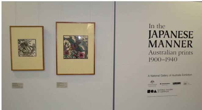
IN THE JAPANESE MANNER: AUSTRALIAN PRINTS 1900 - 1940 A NATIONAL GALLERY OF AUSTRALIA EXHIBITION 20 May until 14 August

In the Japanese manner: Australian prints 1900 – 1940 presents prints produced in the first half of the twentieth century inspired by ukiyo-e, traditional Japanese woodblock prints.