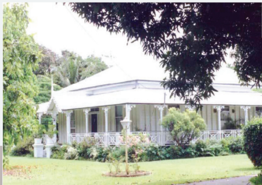
Rosebank today