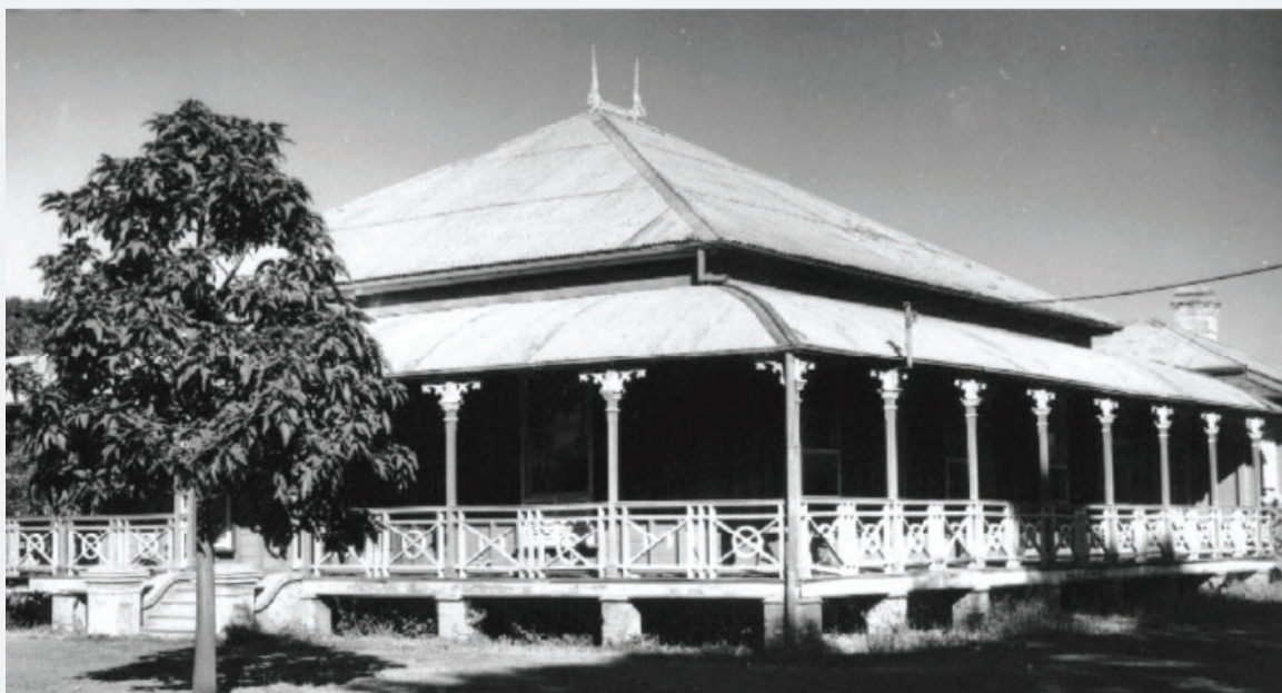
Rosebank CityLibraries Townsville, Local History Collection