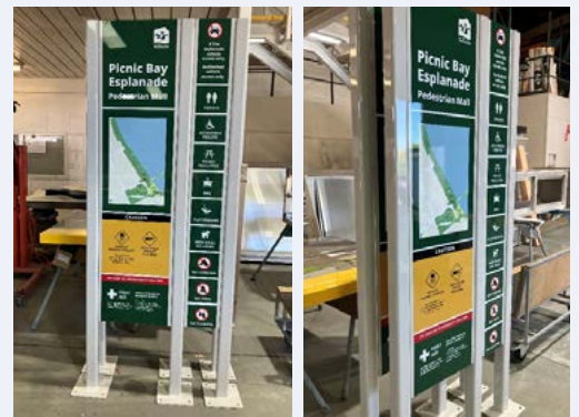
Signs at Council Sign Shop ready for installation.

The signage also provides important safety information on treating tropical marine stingers, along with clear guidance on authorised vehicle access. A new map has been included to support wayfinding, making it simpler for everyone to navigate and enjoy the area.