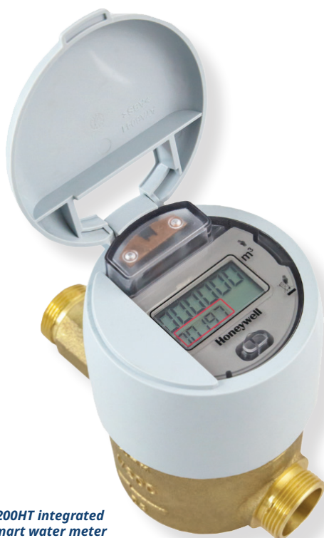
V200HT integrated smart water meter