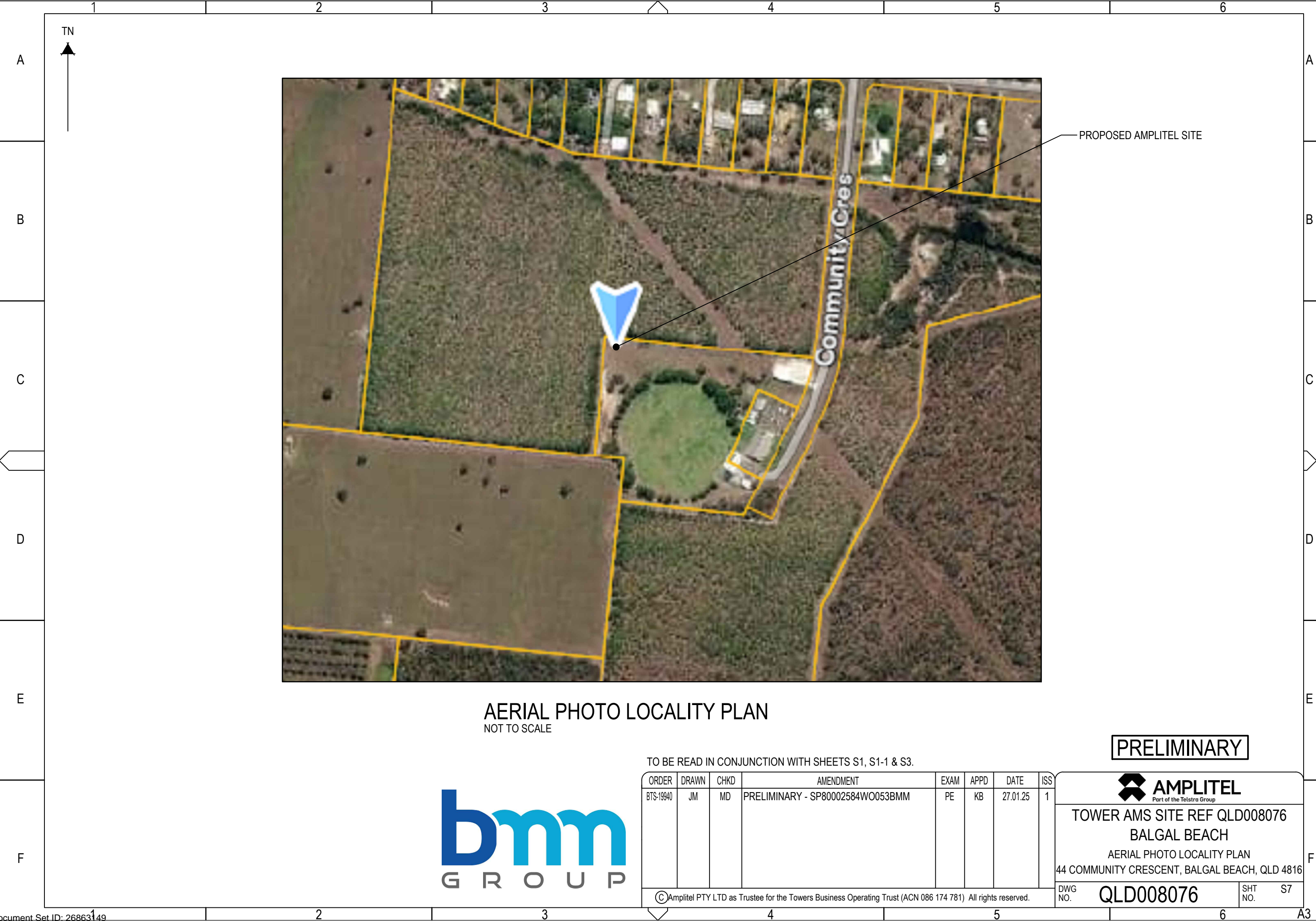
AERIAL PHOTO LOCALITY PLAN NOT TO SCALE