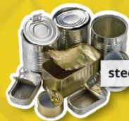
steel/aluminium cans & foil