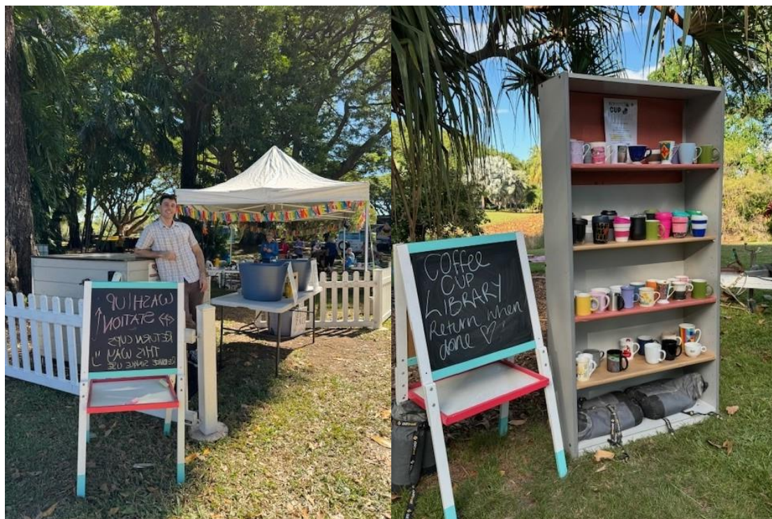
Figure 7: Wash up station & mug library

Food vendors at selected Council run events may have the opportunity to participate in a reuse library and wash up initiative to reduce waste. The Events team will provide more information about being involved for selected events.