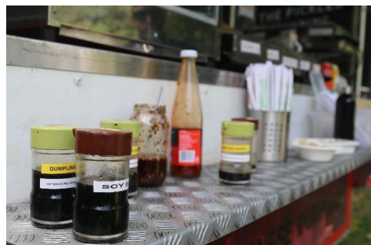
Figure 9: Condiment table