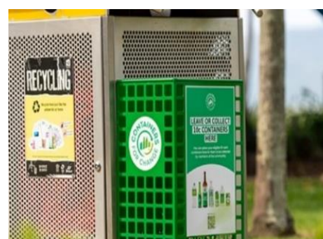
Figure 6: Containers 4 Change

Check the 10c refund mark on the container if you are unsure.