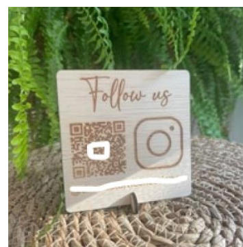
Figure 14: Etched QR code on timber