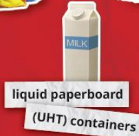
liquid paperboard (UHT) containers