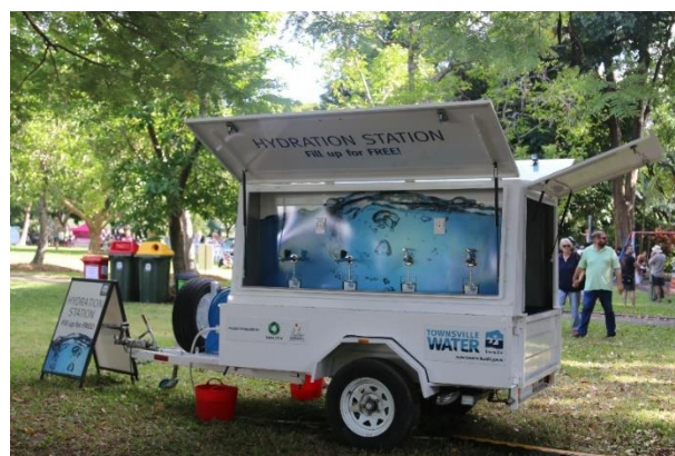
Figure 8: Portable Hydration station

To curb single-use plastic bottle use, Hydration Stations will be set up at select events to encourage patrons to fill up their water for free.