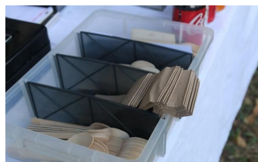
Figure 11: home compostable items