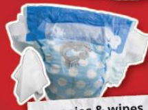
nappies & wipes