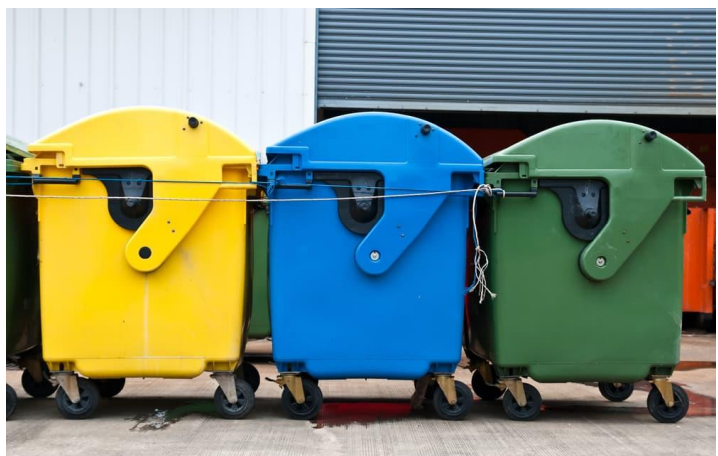
Figure 3: example of skip bins