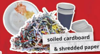
soiled cardboard & shredded paper