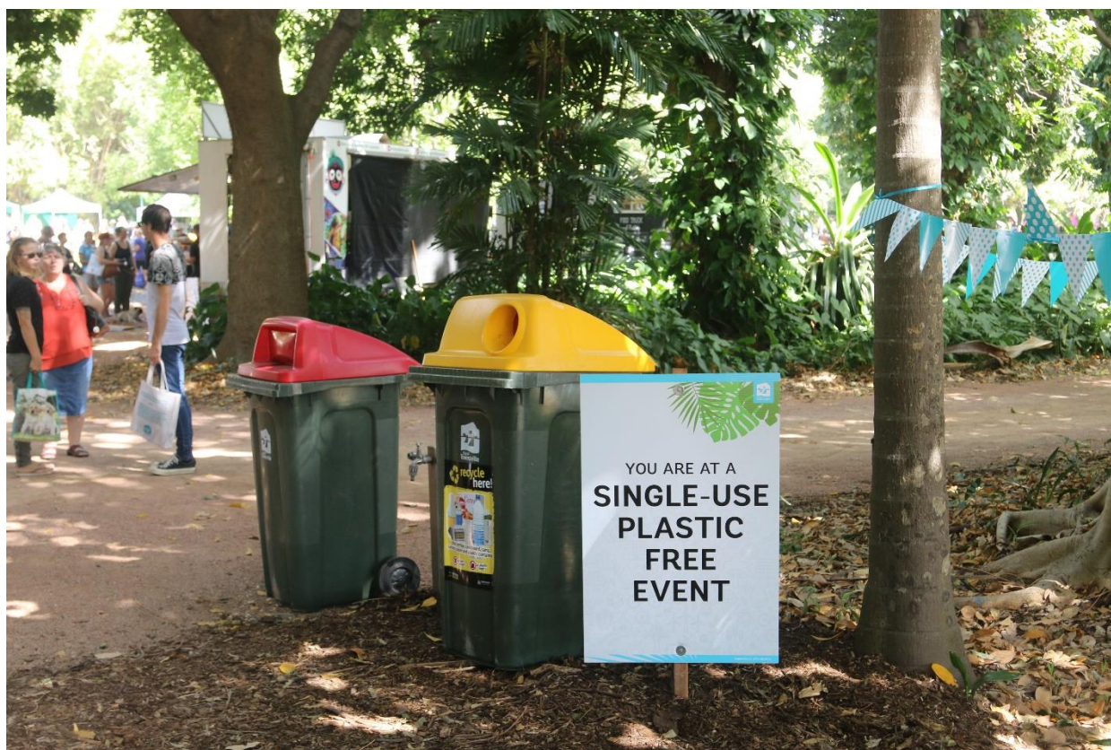
Figure 1: Signage at the 2019 Eco Fiesta Council Event