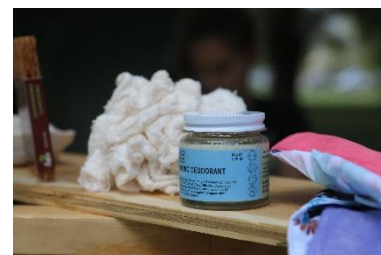
Figure 15: Natural deodorant in a glass container