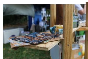
Figure 13: Beeswax wraps