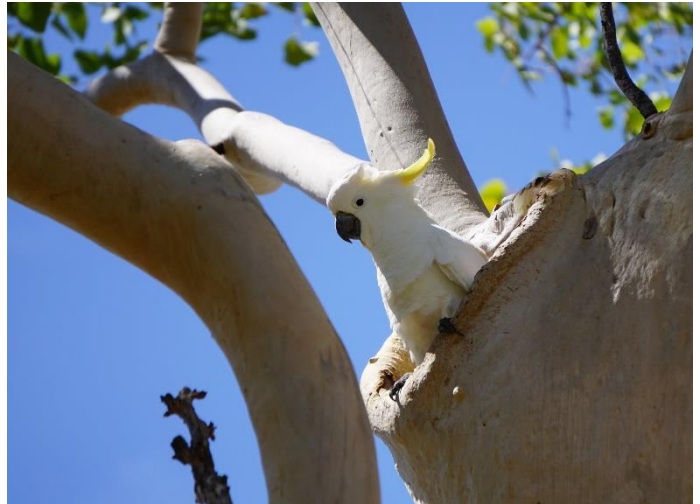
Figure 2: a curious neighbour

Stick to designated travel routes during setup and back down of events, and drive to the speed limit. Native fauna and flora are sensitive and live in the parks and gardens that Council events operate in. It's important to leave no trace and to leave the site as we found it.