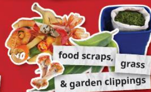
food scraps, grass & garden clippings