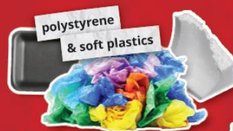
polystyrene & soft plastics