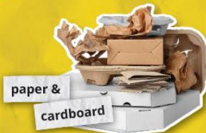
paper & cardboard

Items that are hazardous or could cause damage CANNOT be placed in your yellow lid bin.