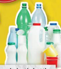
hard plastic bottles & containers