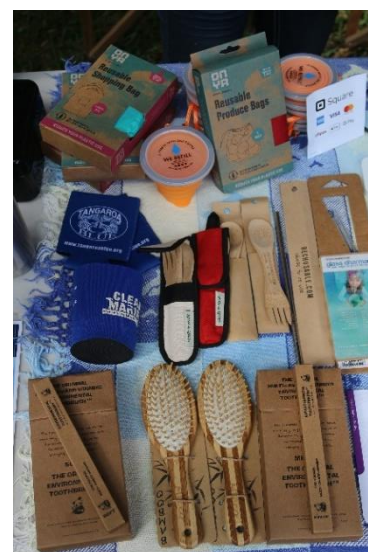
Figure 12: Bamboo products