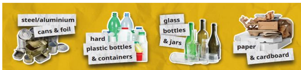
Figure 5: Townsville's recyclables

Resource recovery and waste minimisation is a key driver of our goal to facilitate a shift towards a circular economy and reach our target of diverting 60% of material from landfill by 2026 . Sending waste to landfill not only takes up valuable and finite space, but also increases pressures on natural resources and emits powerful greenhouse gases.