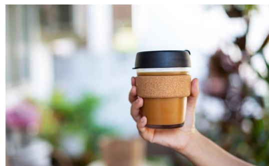
Figure 10: Reusable cup