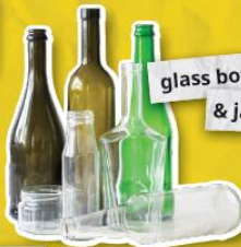
glass bottles & jars